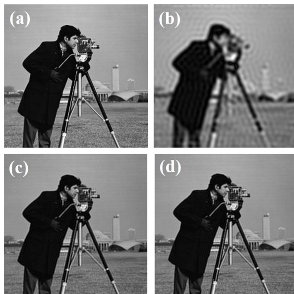
Fig. 3. The simulated imaging results restored by Tikhonov regularization. (a) Original image. (b) Restored image of individual subaperture. (c) Restored image of Ring6. (d) Restored image of effective aperture of Ring6.

In contrast, the Ring6 system can combine the light captured by subaperture metalenses to capture a higher spatial resolution than possible from any of the individual subapertures [19] . As seen in Fig. 2(f), no zero point appeared in the MTF of Ring6, and the blurred image can be restored by using Tikhonov regularization. As previously mentioned, the diameter of the metalens is 21.6 \mu\text{m} . Thus, the area of the individual metalens and the effective aperture of Ring6 are 366 \mu\text{m}^2 and 3.47 \times 10^3 \mu\text{m}^2 . The extension ratio is the effective aperture of Ring6 divided by the individual metalens. The extension ratio of Ring6 ( F = 64.62\% ) is 9.48. As it continues to decrease the fill factors, the extension ratio of Ring6 can be up to 20 until the zero point of the MTF of Ring6 appears.